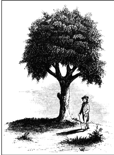
Liberty Tree artwork, courtesy Clipart ETC

Module #7: Nonaggression Faith sets forth key ideas for establishing a 'religion,' a central belief of which is the nonaggression principle. The quick dissemination of the SNaP as a way of life socially—a set of firm beliefs that may not be compromised to civil agencies of coercion—will hasten the clearing of the Barrier Cloud. Other two foundations: presence and reason.